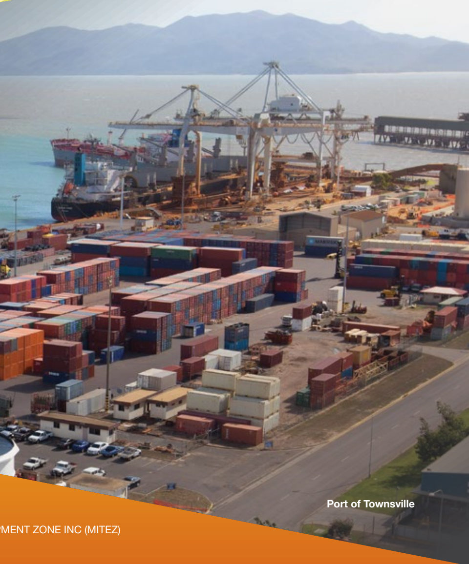
Port of Townsville

Industry contribution to Gross Regional Product for the MITEZ region is estimated to be around $14.3 billion in 2011-12 (AEC Group). The major sectors are mining 17%, construction 12%, public administration 11%, health care and social services 7%, transport, postal and warehousing 7%.