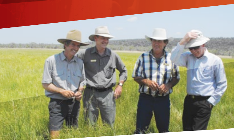
Boodjamulla (Lawn Hill) National Park

Value adding industries and industrial precincts in each of the MITEZ communities.